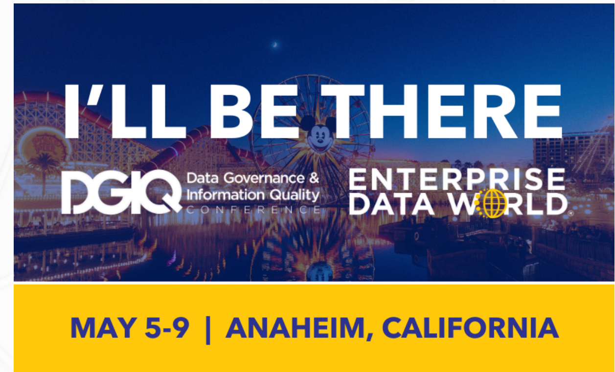
Example of Attendee Button

Download one of our attendee buttons here and link to dgiqconference.com .