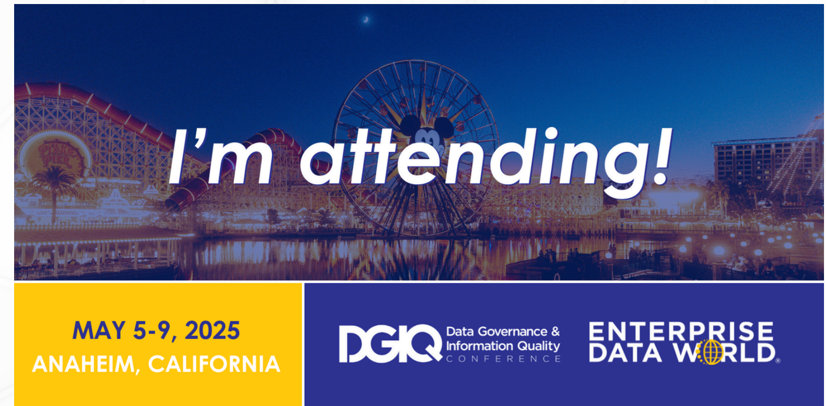
Example of Social Media Graphic

Download one of our attendee graphics here , and share you'll be there with your friends and colleagues.